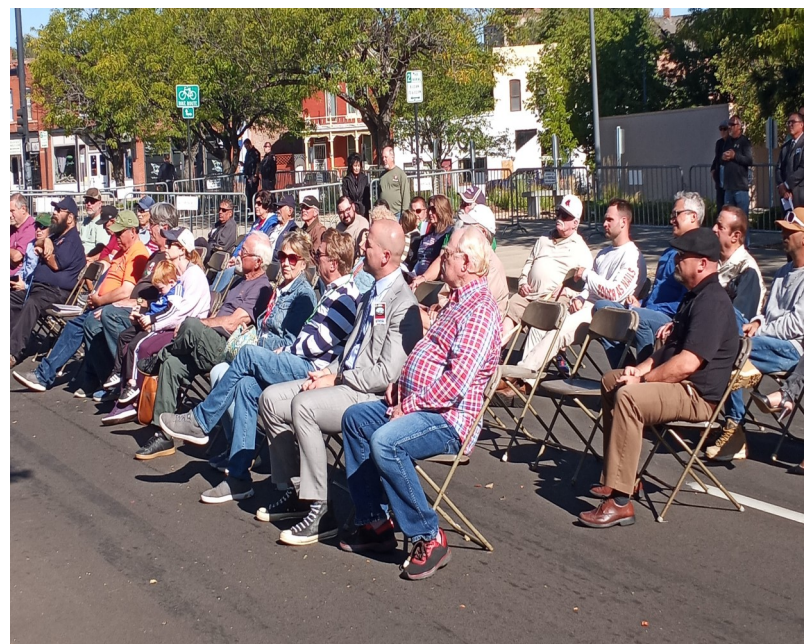
Crowd at Monument